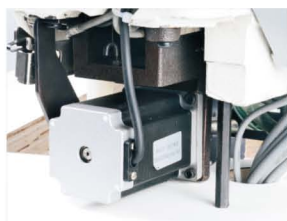
步进电机送料 Stepping motor feeding