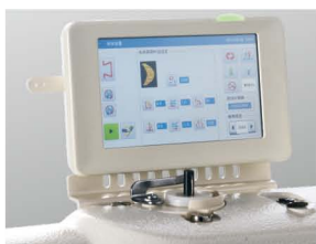
内置350多种花样 Loaded more than 350 patterns