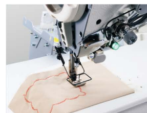
镜像缝功能 Mirror inversion switch